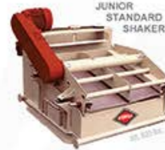
JUNIOR STANDARD SHAKER