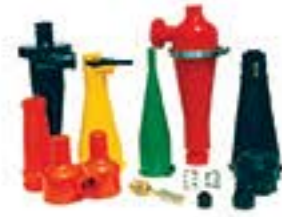
HYDROCYCLONES For all O.E.M.