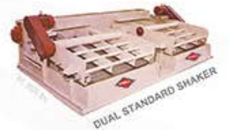
DUAL STANDARD SHAKER