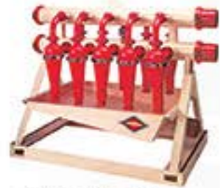
4" & 5" DESILTERS