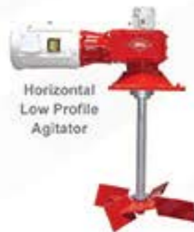
Horizontal Low Profile Agitator