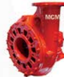
12x14x22 XL Pump