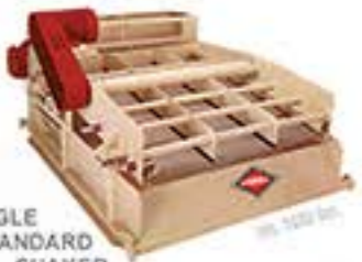
SINGLE STANDARD SHAKER