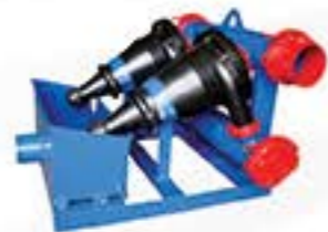
12" Horizontal Desander