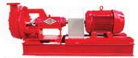
Mission® & Halco® Type Pumps & Skid Mounts