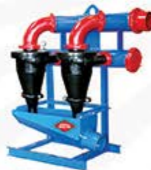
12" Vertical Desander