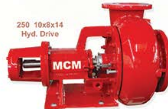
250 10x8x14 Hyd. Drive