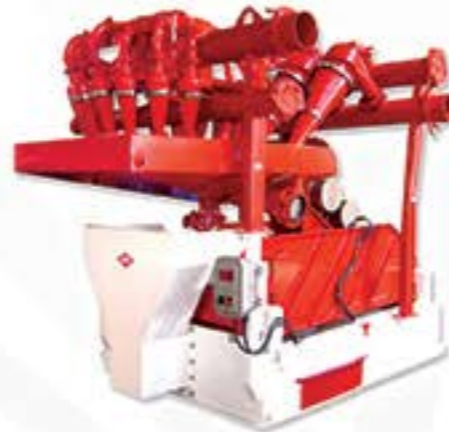
MUD CONDITIONER UNIT