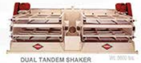
DUAL TANDEM SHAKER