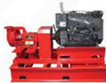
Diesel Engine Skid Package