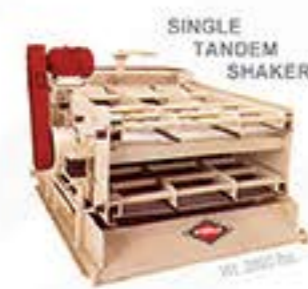
SINGLE TANDEM SHAKER