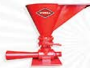
4" & 6" MUD HOPPERS