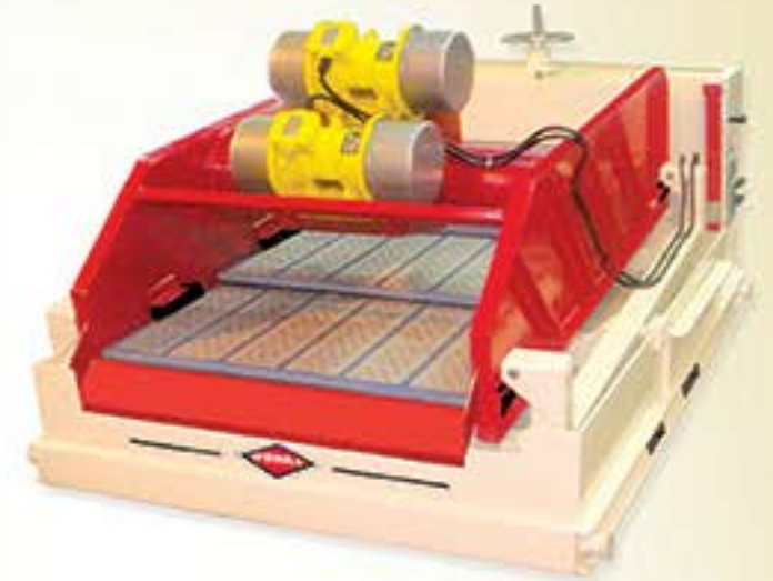
Heavy Duty Linear Motion Shaker